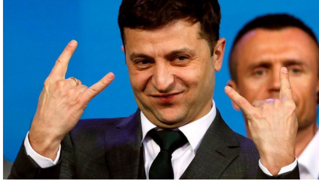
The actor-president, Zelenskyy

Like all of these bankers' wars in the Anglosphere, the producers have their top generals on the payroll but the rest of the actors (the soldiers themselves) are largely unaware of the script and are using live ammo. As always, the casting extras in these things (the "civilians") are both unpaid and ignorant of the very real peril they are in. For example, how foolish does one have to be to imagine being goaded into making Molotov cocktails to toss at modern Russian tanks is a good idea?... or that being handed a battle rifle when they've likely never fired a weapon in their lives won't make them a patriot, but a casualty. These are not acts of desperation to save the motherland, but calculated acts of idiocy to up the civilian body count by the malignant production managers—who keep happening to be Jews for some odd reason... Given the choice of remaining a non-player-character or being targeted by an active player trained and skilled in the use of heavy weapons seems like a no-brainer to me, and I hope that when and if this Broadway play makes it to our country none of us are foolish enough to take the bait.